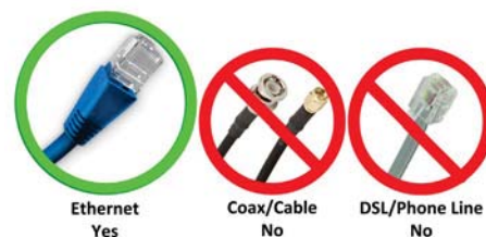
Figure 1: Ethernet cable

Note: No modem needed. There may be multiple wall-ports available, but only the wall-ports labeled ENET or Data support Internet connectivity (see Figure 2). Only Ethernet connectivity is supported; no coax/cable or DSL connections are available (see Figure 1).